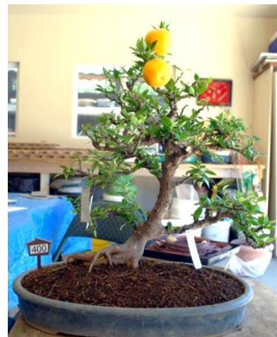
On the right is the tree after basic styling to reveal the trunk and cut back the overgrown foliage.