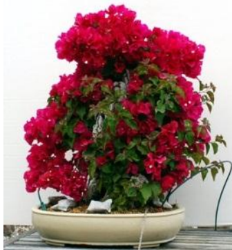
Our bougainvillea while in full bloom at the Garden in July.