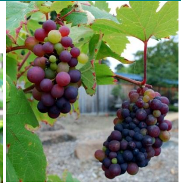
The grape displayed on the front bench has undergone some great transformation. From green to purple it has amazed visitors this month.